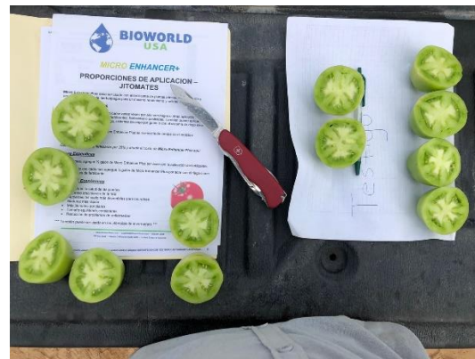
Fruit filling without cavities