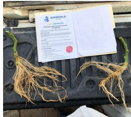
Firmer and more abundant roots.