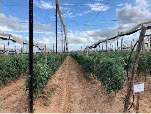
More vigorous plant