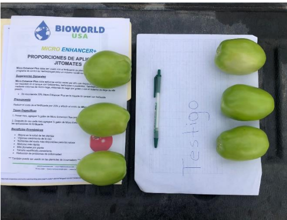
More uniform fruit shape and size