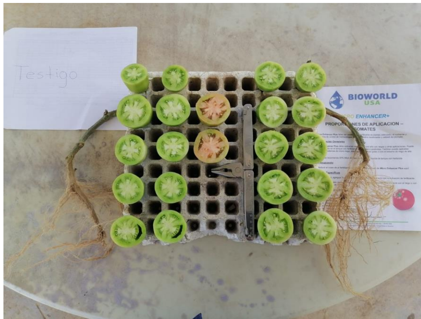
Evaluation of internal fruit filling.